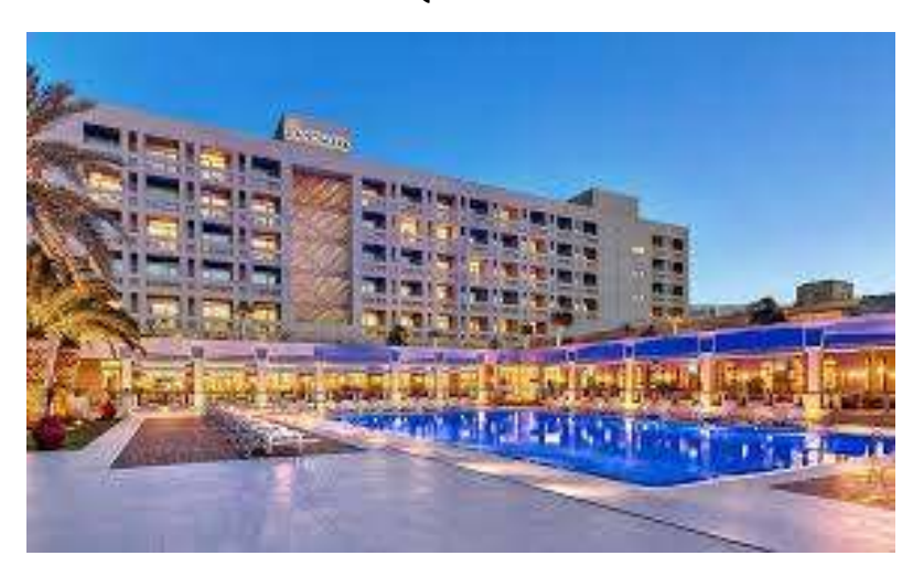
Europa Hotel ***

3-4-5 April 2020 Landmark Hotel ***** HQ